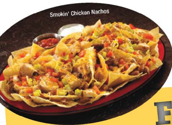
Smokin' Chicken Nachos

Tender-smoked chicken, cheese, tomatoes, caramelized onions and peppers, melted in a Cheddar tortilla. 6.99