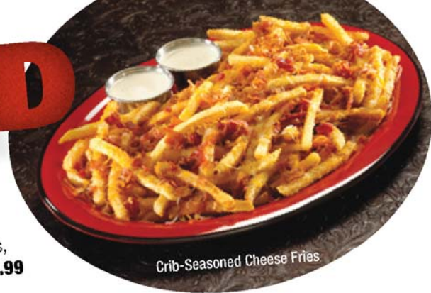
Crib-Seasoned Cheese Fries

Lightly breaded mozzarella cheese and fried mushrooms served on a bed of fries, all ready for a dip in zesty marinara sauce and Ranch dressing. 6.49