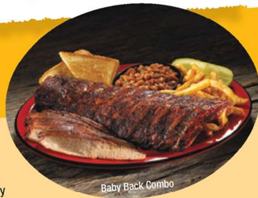
Baby Back Combo