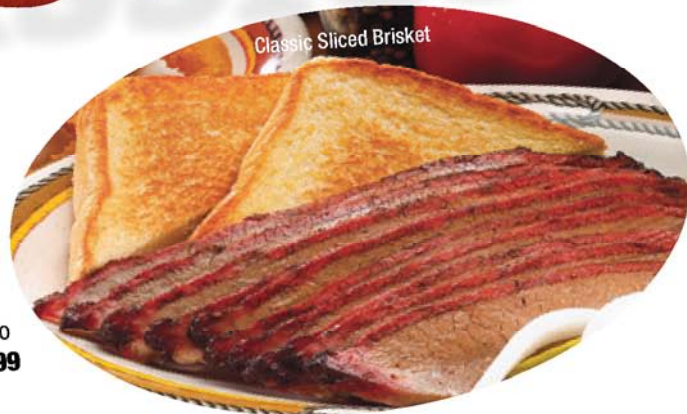
Classic Sliced Brisket

ADD A ST. LOUIS-STYLE RIB TO ANY ENTRÉE 1.99