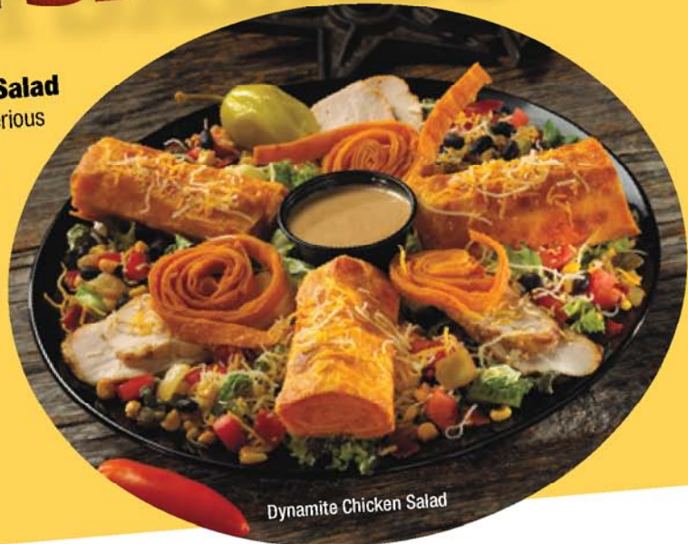
Dynamite Chicken Salad

This salad packs some serious pow! Succulent slices of hickory-smoked chicken breast add savory flavor a salad of fresh greens, Southwest corn medley, tomatoes and cheese. Garnished with three cheese quesadilla rollups and served with barbecue Ranch dressing. 7.99